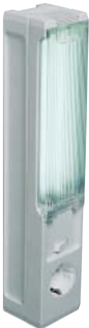
Lamp shown with protective plastic cover (see Accessories)