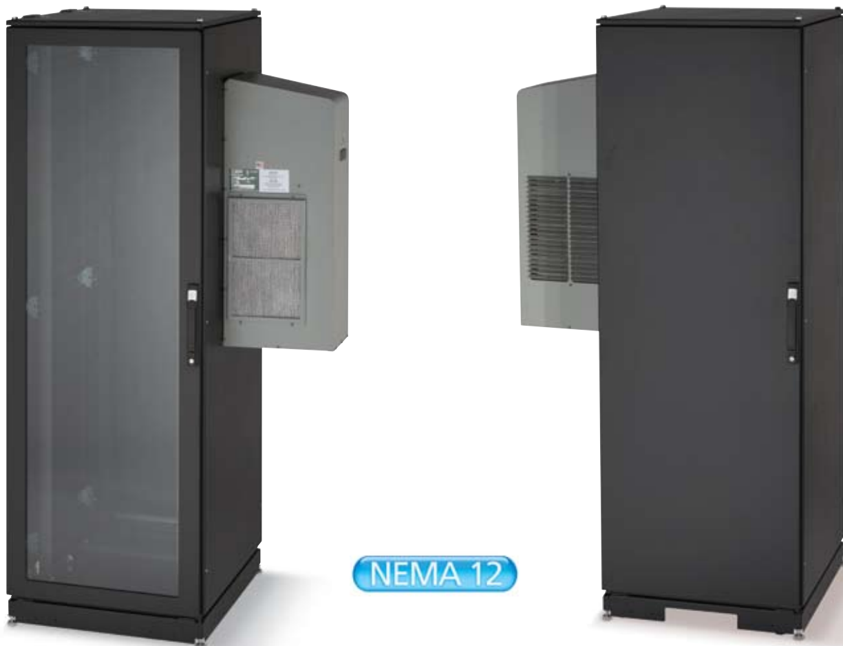
Included AC unit mounts on the side of the ClimateCab cabinet. Installation takes about five minutes. CC42U5000T: left: front view; right: rear view.

ClimateCab is sealed against dripping water and dust, too. Sealed cable entries prevent air exchange. The digitally controlled air-conditioning unit (included) keeps your equipment comfortably cool. Just install your equipment, plug in the AC unit, and you have a complete, self-contained, self-supporting data center!