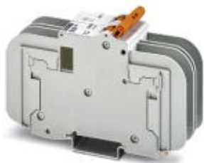
Thermomagnetic device circuit breaker, Width: 35.3 mm, Mounting type: DIN rail, Color: gray

Please be informed that the data shown in this PDF Document is generated from our Online Catalog. Please find the complete data in the user's documentation. Our General Terms of Use for Downloads are valid ( http://phoenixcontact.com/download )