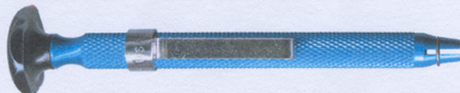
Interchangeable Aluminum Handle for 2-in-1 Reversible Blades Stock No. 49-8027

These miniature handles are traditional fluted style and feature a solid-locking chuck assembly that is permanently molded into the red and yellow plastic. OAL 2.7" & 5/8" diameter.