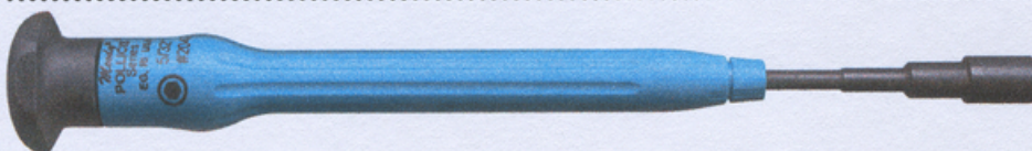
Fixed ESD-Safe Handle (short) Available as complete drivers only

Featuring a chuck style nose, these ESD-Safe handles are ergonomic, Anti-Static and accept traditional Moody screwdriver blades as well as the 3" Extension. Non-roll tops and fluted bodies. OAL 4.5"