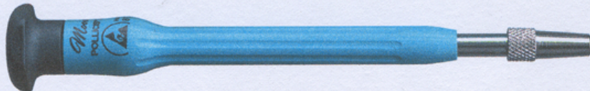
Interchangeable ESD-Safe Handle for Moody's Jewelers Style Blades Stock No. 49-8181

These Ergonomic and Anti-Static (ESD-Safe) handles accept our 2-in-1 reversible screwdriver blades, and feature hex-shaped tops and fluted bodies. Snap-ring secures blade in place. OAL 3.75"