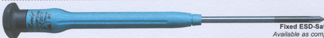
Fixed ESD-Safe Handle (long) Available as complete drivers only

Ergonomic and Anti-Static, these handles feature securely molded blades. Complete with Swivtop™, these are available as complete drivers only, both individually and in sets. Drivers are marked with the size, stock no. & ESD-Safe symbol. Blade length 1.25"; OAL, incl. blade, 4.9"