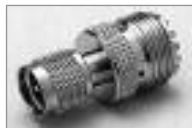
Mini-UHF (M) to Mini-UHF (F)