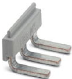
Insertion bridge, Number of positions: 3, Color: gray

Please be informed that the data shown in this PDF Document is generated from our Online Catalog. Please find the complete data in the user's documentation. Our General Terms of Use for Downloads are valid ( http://phoenixcontact.com/download )