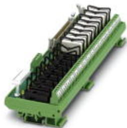
VARIOFACE output module, with 16 miniature relays, 1 PDT each, plugged, for 24 V DC (basic module, including relays)

Please be informed that the data shown in this PDF Document is generated from our Online Catalog. Please find the complete data in the user's documentation. Our General Terms of Use for Downloads are valid ( http://phoenixcontact.com/download )