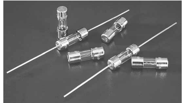
225 000 Series