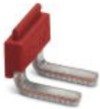
Insertion bridge, Number of positions: 2, Color: red

Insertion bridge - EB 2- DIK RD - 2716693