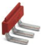
Insertion bridge, Number of positions: 3, Color: red

Insertion bridge - EB 3- DIK RD - 2716745