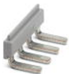
Insertion bridge, Number of positions: 4, Color: red

Insertion bridge - EB 4- DIK RD - 2716758