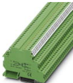
Power solid-state relay terminal block for actuator, input: 24 V DC, output: 3 - 30 V DC/3 A, terminal block width: 6.2 mm

Please be informed that the data shown in this PDF Document is generated from our Online Catalog. Please find the complete data in the user's documentation. Our General Terms of Use for Downloads are valid ( http://phoenixcontact.com/download )