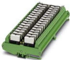
Varioface output module, with 32 miniature relays, 1 PDT, plugged, for 24 V DC (incl. relay)

Please be informed that the data shown in this PDF Document is generated from our Online Catalog. Please find the complete data in the user's documentation. Our General Terms of Use for Downloads are valid ( http://phoenixcontact.com/download )