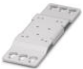
Universal wall adapter

Assembly adapters - UWA 182/52 - 2938235