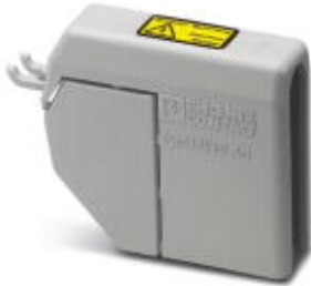
Covering hood, Width: 43 mm, Height: 71 mm, Color: gray

Please be informed that the data shown in this PDF Document is generated from our Online Catalog. Please find the complete data in the user's documentation. Our General Terms of Use for Downloads are valid ( http://phoenixcontact.com/download )