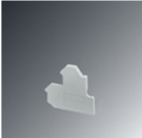
End cover, Width: 2.2 mm, Number of positions: 1, Color: gray

Please be informed that the data shown in this PDF Document is generated from our Online Catalog. Please find the complete data in the user's documentation. Our General Terms of Use for Downloads are valid ( http://phoenixcontact.com/download )