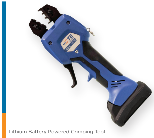
Lithium Battery Powered Crimping Tool

Designed for maximum flexibility, speed and ergonomics