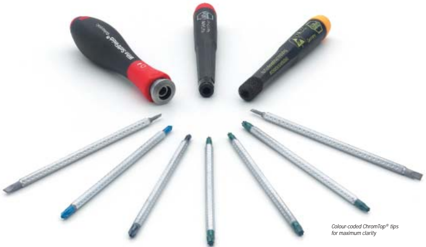
Colour-coded ChromTop® tips for maximum clarity

A Real Multi-tasker and Ideal for Precision Work.