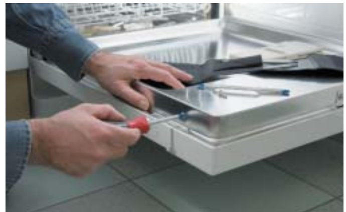
Convincing variety and quality. SYSTEM 4 – a real multi-tasker.

We offer SYSTEM 4 sets in compact roll-up pouches, rugged metal and easy access plastic boxes.