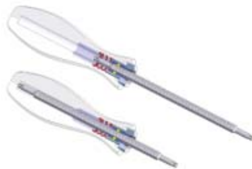
With the SoftFinish® telescopic handle, the blade length can be adjusted from 18 - 90 mm.