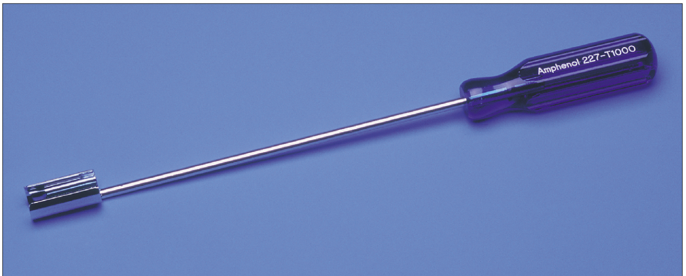
The Amphenol ® 12" BNC Installation/Removal Tool

This Tool is Perfect for High Density Panel Applications!