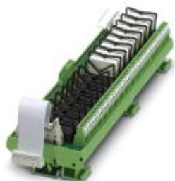
VARIOFACE output extension module, with plug-in bases for 16 miniature relays, 1 PDT each, for 24 V DC (without relays)

Please be informed that the data shown in this PDF Document is generated from our Online Catalog. Please find the complete data in the user's documentation. Our General Terms of Use for Downloads are valid ( http://phoenixcontact.com/download )