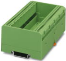
Electronic housing, for PCB insertion, without screw connection terminal blocks and cover

Please be informed that the data shown in this PDF Document is generated from our Online Catalog. Please find the complete data in the user's documentation. Our General Terms of Use for Downloads are valid ( http://phoenixcontact.com/download )