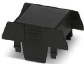
Component housing connection opening on both sides, Color: black, Width: 45 mm

Please be informed that the data shown in this PDF Document is generated from our Online Catalog. Please find the complete data in the user's documentation. Our General Terms of Use for Downloads are valid ( http://phoenixcontact.com/download )