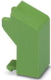
Filler plugs, for unoccupied terminal points

Please be informed that the data shown in this PDF Document is generated from our Online Catalog. Please find the complete data in the user's documentation. Our General Terms of Use for Downloads are valid ( http://phoenixcontact.com/download )