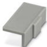
Equipment marker tag, width 22 mm