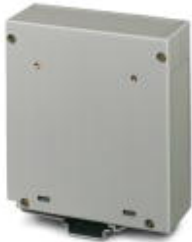
Electronics housing, for insertion of two PCBs, without screw connection terminal blocks

Please be informed that the data shown in this PDF Document is generated from our Online Catalog. Please find the complete data in the user's documentation. Our General Terms of Use for Downloads are valid ( http://phoenixcontact.com/download )