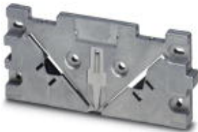
Mounting plate for Ruggedline devices

Please be informed that the data shown in this PDF Document is generated from our Online Catalog. Please find the complete data in the user's documentation. Our General Terms of Use for Downloads are valid ( http://phoenixcontact.com/download )