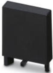
Plug-in module, for mounting on PR3, with varistor, input voltage: 12-24 V AC/DC ± 20%

Please be informed that the data shown in this PDF Document is generated from our Online Catalog. Please find the complete data in the user's documentation. Our General Terms of Use for Downloads are valid ( http://phoenixcontact.com/download )