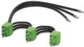
Figure shows variant for 3 modules

3-phase loop bridge for 9 CONTACTRON modules, with screw connection and 22.5 mm housing width, connecting cable: 0.3 m, with ferrules.