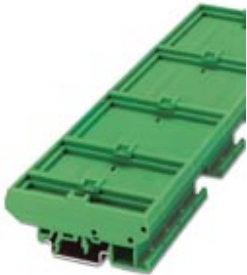
Electronic board base, plug-in module base element

Please be informed that the data shown in this PDF Document is generated from our Online Catalog. Please find the complete data in the user's documentation. Our General Terms of Use for Downloads are valid ( http://phoenixcontact.com/download )