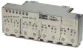
The illustration shows version IBS RL 24 DIO 8/8/8-LK

Digital I/O device for INTERBUS; fiber optic technology with 2 Mbaud, eight inputs (24 V DC), eight outputs (24 V DC, 0.5 A), sensor/actuator connection via 5-pos. M12 female connectors, rugged metal housing, IP67 protection