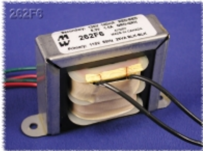
Plate & Filament or Bias 261-262 Series 115 V Primary