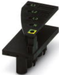
Power plug, for Inline power-level terminals

Please be informed that the data shown in this PDF Document is generated from our Online Catalog. Please find the complete data in the user's documentation. Our General Terms of Use for Downloads are valid ( http://phoenixcontact.com/download )