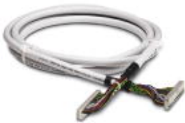
The illustration shows version FLK 40/EZ-DR/200/SLC

Round cable sets, with 40-pos. socket strips to connect to 32-channel I/O cards of the SLC 500, length 0.5 m