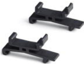
Adapter for mounting on DIN rails.

Please be informed that the data shown in this PDF Document is generated from our Online Catalog. Please find the complete data in the user's documentation. Our General Terms of Use for Downloads are valid ( http://phoenixcontact.com/download )