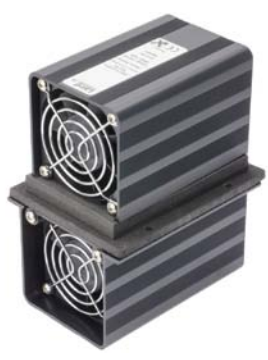
Laird Air-to-Air Tunnel Series