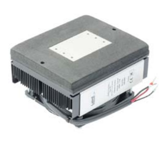
Laird Direct-to-Air PowerCool Series

TEAs are designed and manufactured to strict process control standards and pass/fail criteria, assuring that our customers receive the best possible TEAs. Our standard product portfolio includes an extensive array of thermal management solutions that cover a wide range of cooling capacities with compact form factors and high coefficient of performance. The standard product offering includes heat transfer mechanisms designed to absorb and dissipate heat by convection, conduction or through liquid heat exchangers. All products are manufactured in an ISO 9001:2008 certified facility.