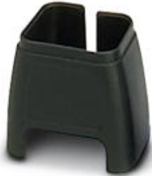
Color marking for patch cable, black

Please be informed that the data shown in this PDF Document is generated from our Online Catalog. Please find the complete data in the user's documentation. Our General Terms of Use for Downloads are valid ( http://phoenixcontact.com/download )