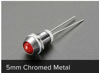
5mm Chromed Metal