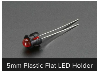
5mm Plastic Flat LED Holder