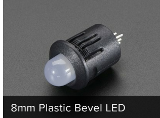
8mm Plastic Bevel LED