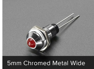
5mm Chromed Metal Wide