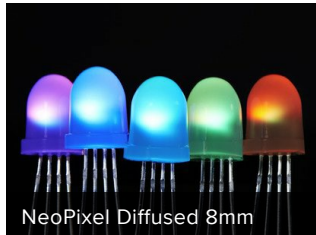
NeoPixel Diffused 8mm