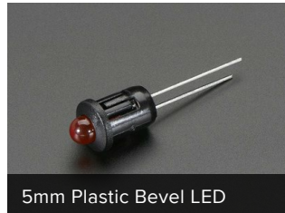
5mm Plastic Bevel LED