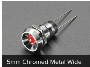
5mm Chromed Metal Wide