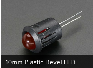
10mm Plastic Bevel LED