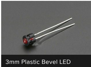
3mm Plastic Bevel LED