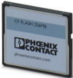
Program and configuration memory, plug-in, 256 MB

Please be informed that the data shown in this PDF Document is generated from our Online Catalog. Please find the complete data in the user's documentation. Our General Terms of Use for Downloads are valid ( http://phoenixcontact.com/download )