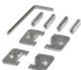
HMI mounting kit for installation on a front plate. The mounting kit includes 6 x mounting brackets, 6 x screw threads, and a hexagonal wrench.

Mounting kit - HMI SCB MOUNTING KIT 6 - 2701385