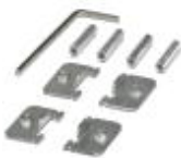
HMI mounting kit for installation on a front plate. The mounting kit includes 4 x mounting brackets, 4 x screw threads, and a hexagonal wrench.

Mounting kit - HMI SCB MOUNTING KIT 4 - 2701384