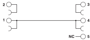
PLC-VT connection scheme