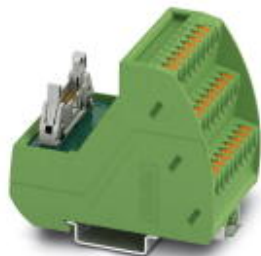
VARIOFACE sensor module, with push-in connection, for connecting 8 pnp sensors

Please be informed that the data shown in this PDF Document is generated from our Online Catalog. Please find the complete data in the user's documentation. Our General Terms of Use for Downloads are valid ( http://phoenixcontact.com/download )