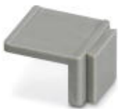
Equipment marker, narrow

Marking material - EMG-SGKS 10 - 2947585