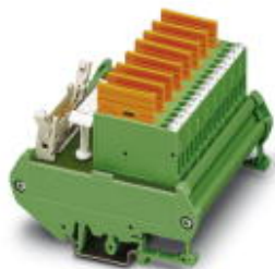
Fuse module (for analog output cards of the Delta V control system)

Please be informed that the data shown in this PDF Document is generated from our Online Catalog. Please find the complete data in the user's documentation. Our General Terms of Use for Downloads are valid ( http://phoenixcontact.com/download )