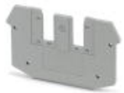
Basic terminal block, length: 63.5 mm, width: 1.5 mm, color: gray

Basic terminal block - D-UDK-RELG - 2777027