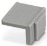
Equipment marker, width 12 mm