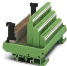
VARIOFACE module, for IEC 603/DIN 41612 connector, type F, 48-pos., z, b, d components mounted, with male connector, cable housing with screw interlock

Please be informed that the data shown in this PDF Document is generated from our Online Catalog. Please find the complete data in the user's documentation. Our General Terms of Use for Downloads are valid ( http://phoenixcontact.com/download )