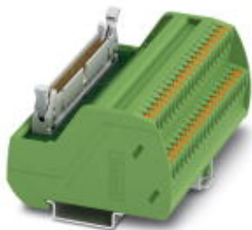
VARIOFACE interface module for Siemens SIMATIC® S7-300, with SIMATIC®-specific labeling (1 - 40), with push-in connection, module width: 107.9 mm

Please be informed that the data shown in this PDF Document is generated from our Online Catalog. Please find the complete data in the user's documentation. Our General Terms of Use for Downloads are valid ( http://phoenixcontact.com/download )