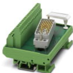
VARIOFACE module, for ELCO connector, for mounting on NS 35/7.5 or NS 32, with pin strip 8016 right, no. of positions 32

Please be informed that the data shown in this PDF Document is generated from our Online Catalog. Please find the complete data in the user's documentation. Our General Terms of Use for Downloads are valid ( http://phoenixcontact.com/download )