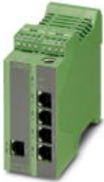
Ethernet Lean Managed Switch with five 10/100 Mbps RJ45 ports

Please be informed that the data shown in this PDF Document is generated from our Online Catalog. Please find the complete data in the user's documentation. Our General Terms of Use for Downloads are valid ( http://phoenixcontact.com/download )