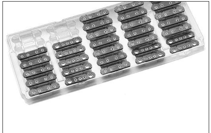
Figure 15-2 — SurfMates; Individual part numbers