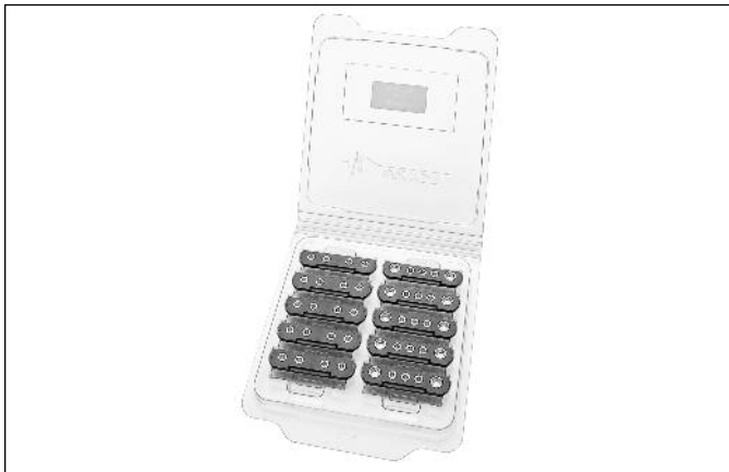
Figure 15-1 — SurfMates; Five pair sets