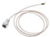
Adapter cable, pigtail 120 cm 90° MCX(m) -> N(m)

Antenna cable - RAD-CON-MCX90-N-SS - 2885207