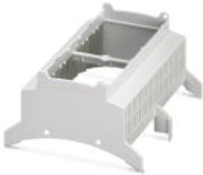
Upper part for installation housing BC, width: 107.6 mm, wiring space depth: 11 mm

Please be informed that the data shown in this PDF Document is generated from our Online Catalog. Please find the complete data in the user's documentation. Our General Terms of Use for Downloads are valid ( http://download.phoenixcontact.com )