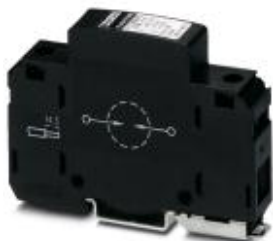
Lightning current arrester with encapsulated N-PE spark gap and ignition electronics, 1-channel. Protection level 1.5 kV. Housing width: 17.5 mm (1 Div.)

Please be informed that the data shown in this PDF Document is generated from our Online Catalog. Please find the complete data in the user's documentation. Our General Terms of Use for Downloads are valid ( http://phoenixcontact.com/download )